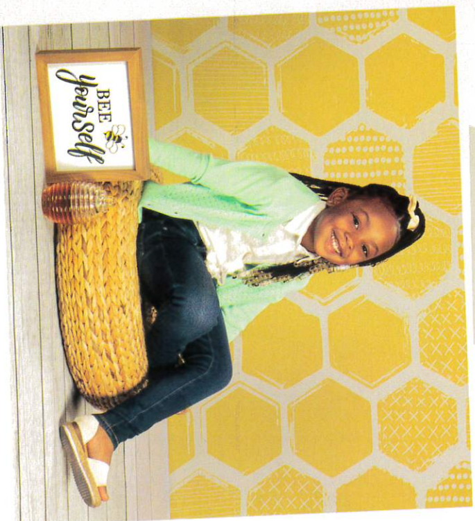
“Sweet As Can Bee” Background Fondo “Dulce como una abeja”